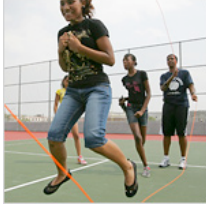
Double Dutch Gets Status in the Schools