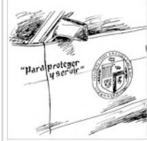
Op-Ed: The Laws Cops Can't Enforce

Home | World | U.S. | N.Y. / Region | Business | Technology | Science | Health | Sports | Opinion | Arts | Style | Travel | Jobs | Real Estate | Automobiles | Back to Top