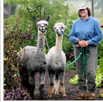
Where Foliage Eclipses Flowers