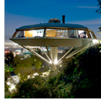
Bonding Humanity and Landscape

Who would be the worse selection: Mitt Romney or Tim Kaine?